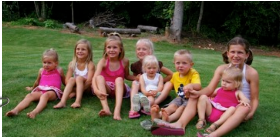
The eight grands, eight years old and under